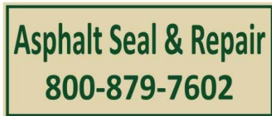
2 or 3 lines one color

$350 (Covers first two years $175 a year) $250 a year renewal. Plus receive 6 free rounds worth $270