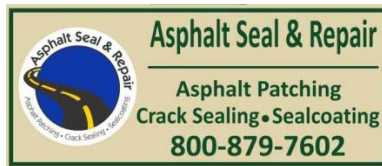
color logo and text