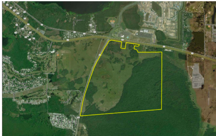
Southern Oaks Phase 6A will be located on 514 acres at State Road 44 and County Road 468E.

Across the street from Villages Grown, commissioners also endorsed the master plan for the Villages of Southern Oaks phase 6A on 514 acres near the southeast corner of SR 55 and Morse Boulevard.